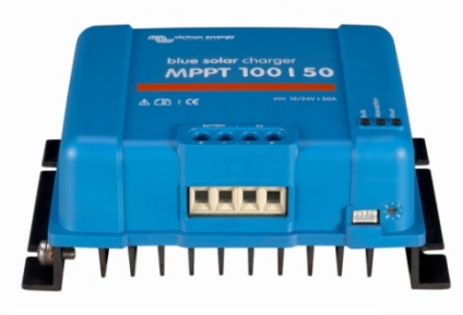
Solar Charge Controller MPPT 100/50